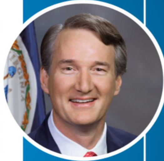
GOVERNOR GLENN YOUNGKIN

Our priority is to have a comprehensive Virginia Energy Plan that considers all energy sources, provides transparent and data-driven information for Virginians about costs, and is an 'all of the above' approach. We believe energy policy isn't about things; it's about people. How energy is generated and delivered to Virginians and Virginia Businesses should accommodate the current and future needs of all Virginians.