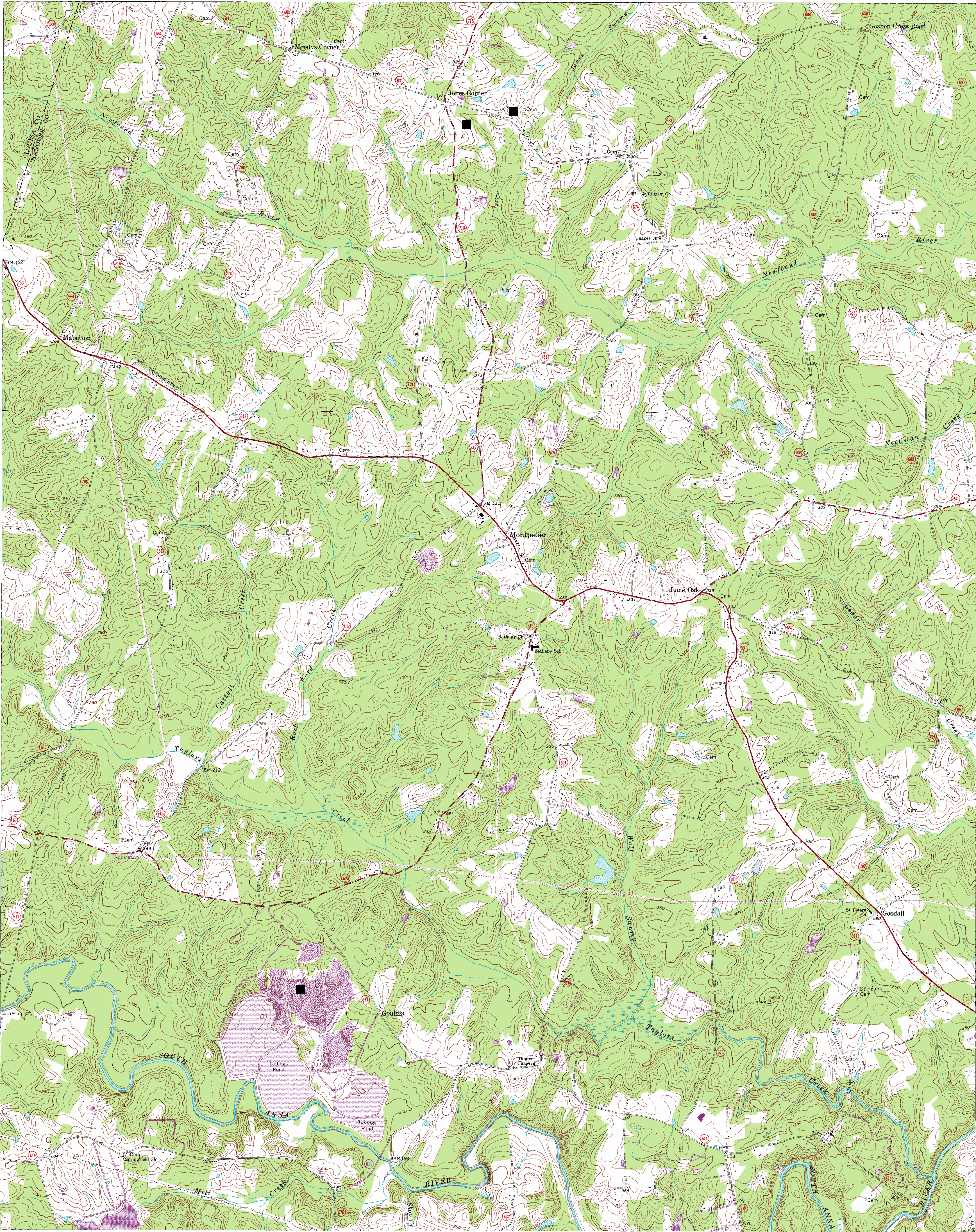
USGS 7.5' Topographic Quadrangle