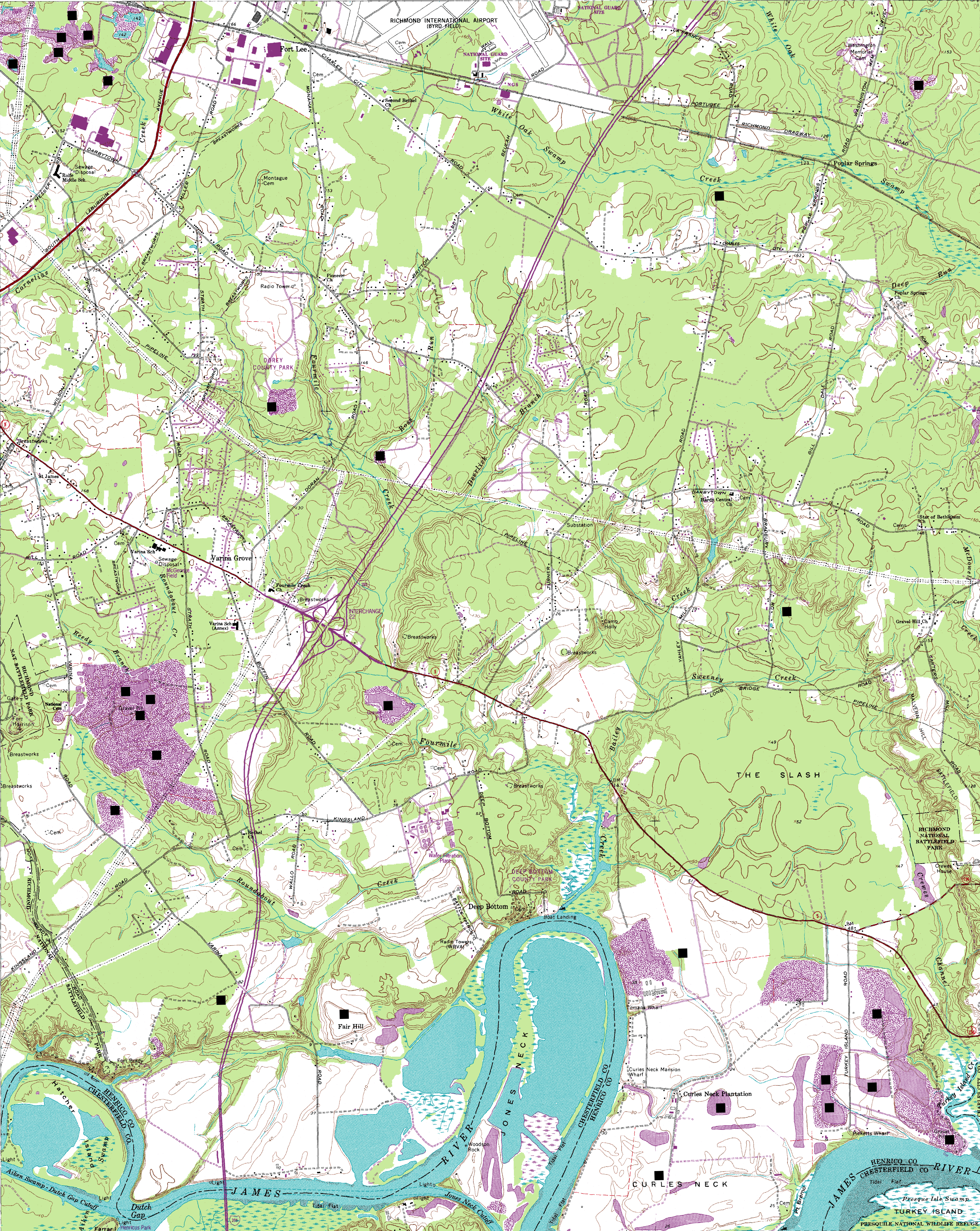
USGS 7.5' Topographic Quadrangle