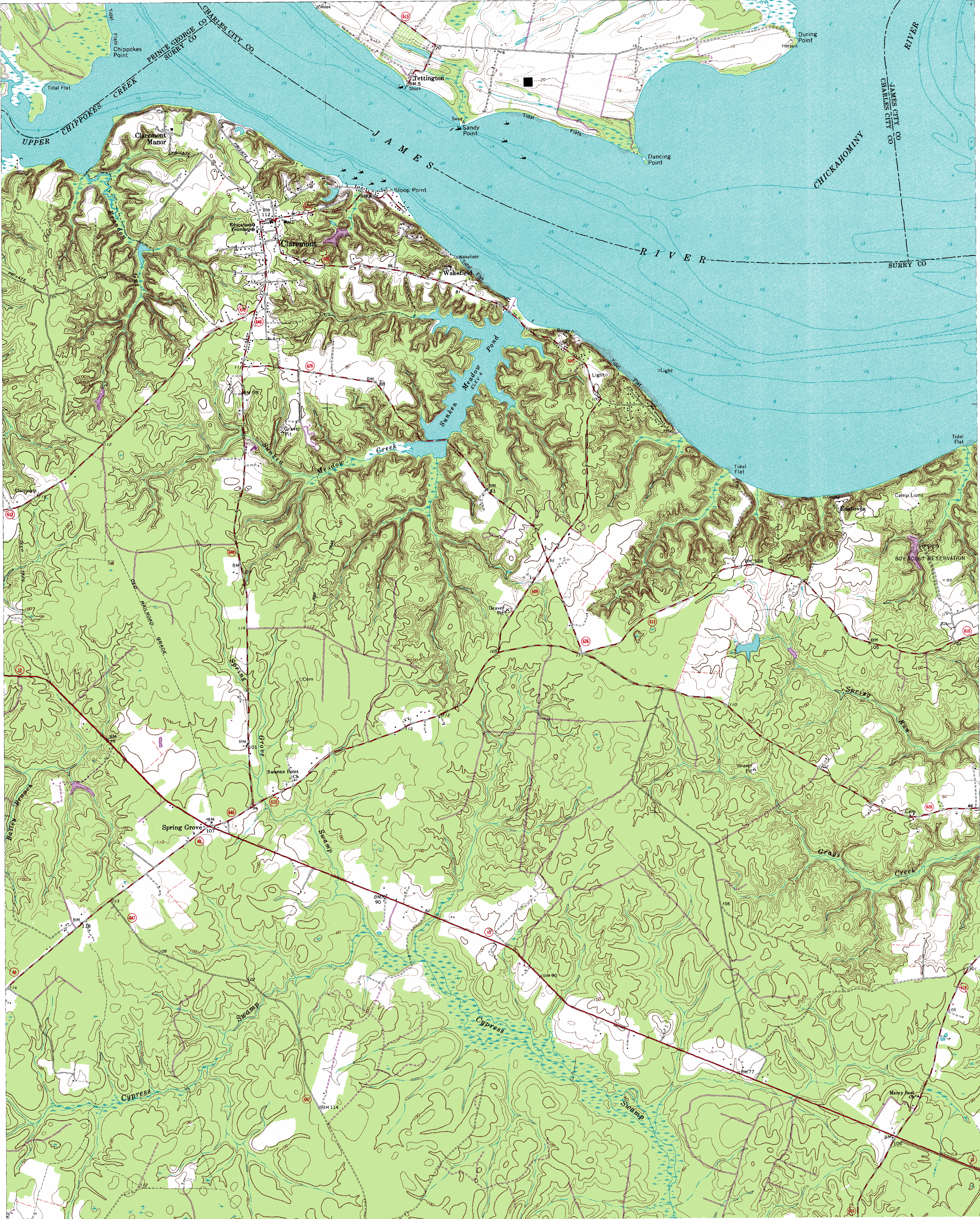
USGS 7.5' Topographic Quadrangle